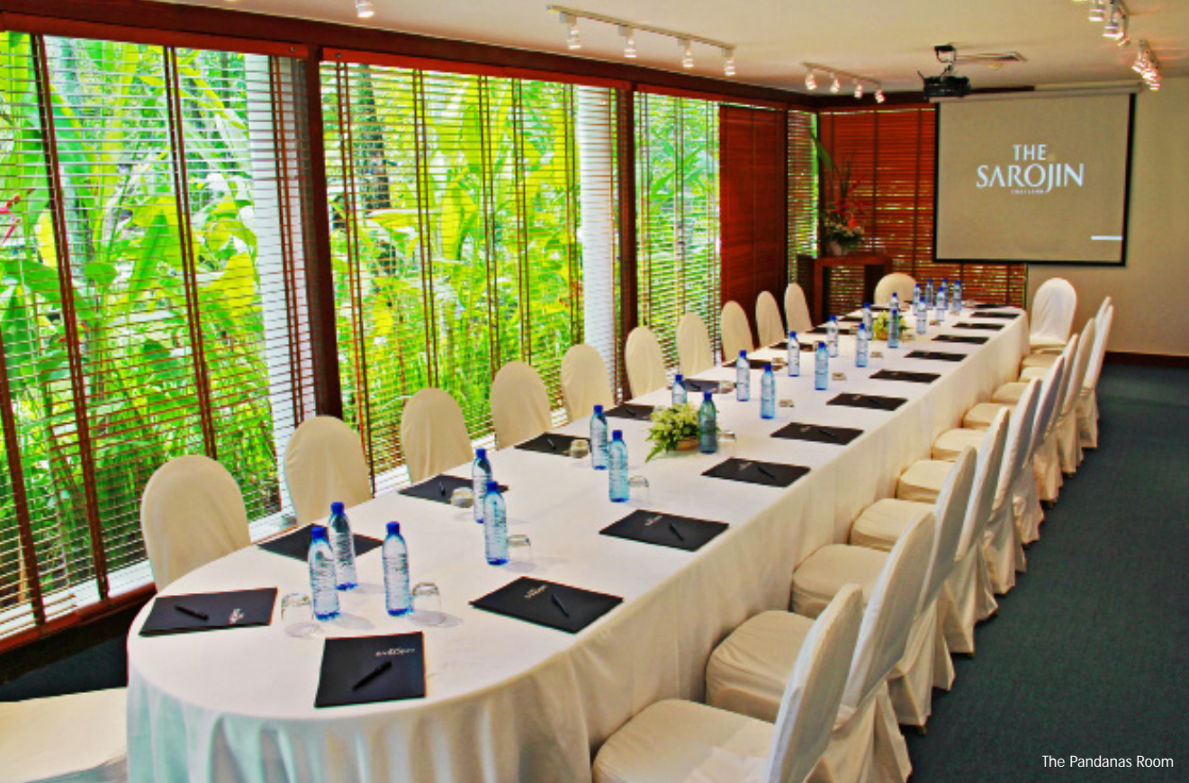
The Pandanas Room