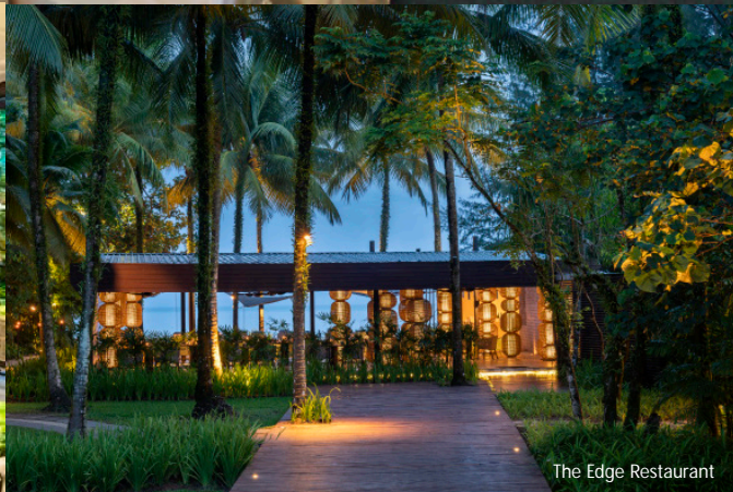
The Edge Restaurant

The Sarojin provides the following equipment on a complimentary basis