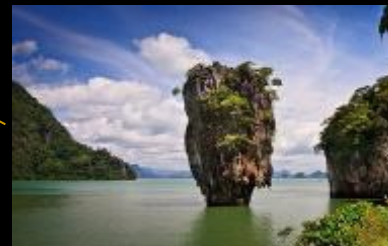
Phang Nga Bay