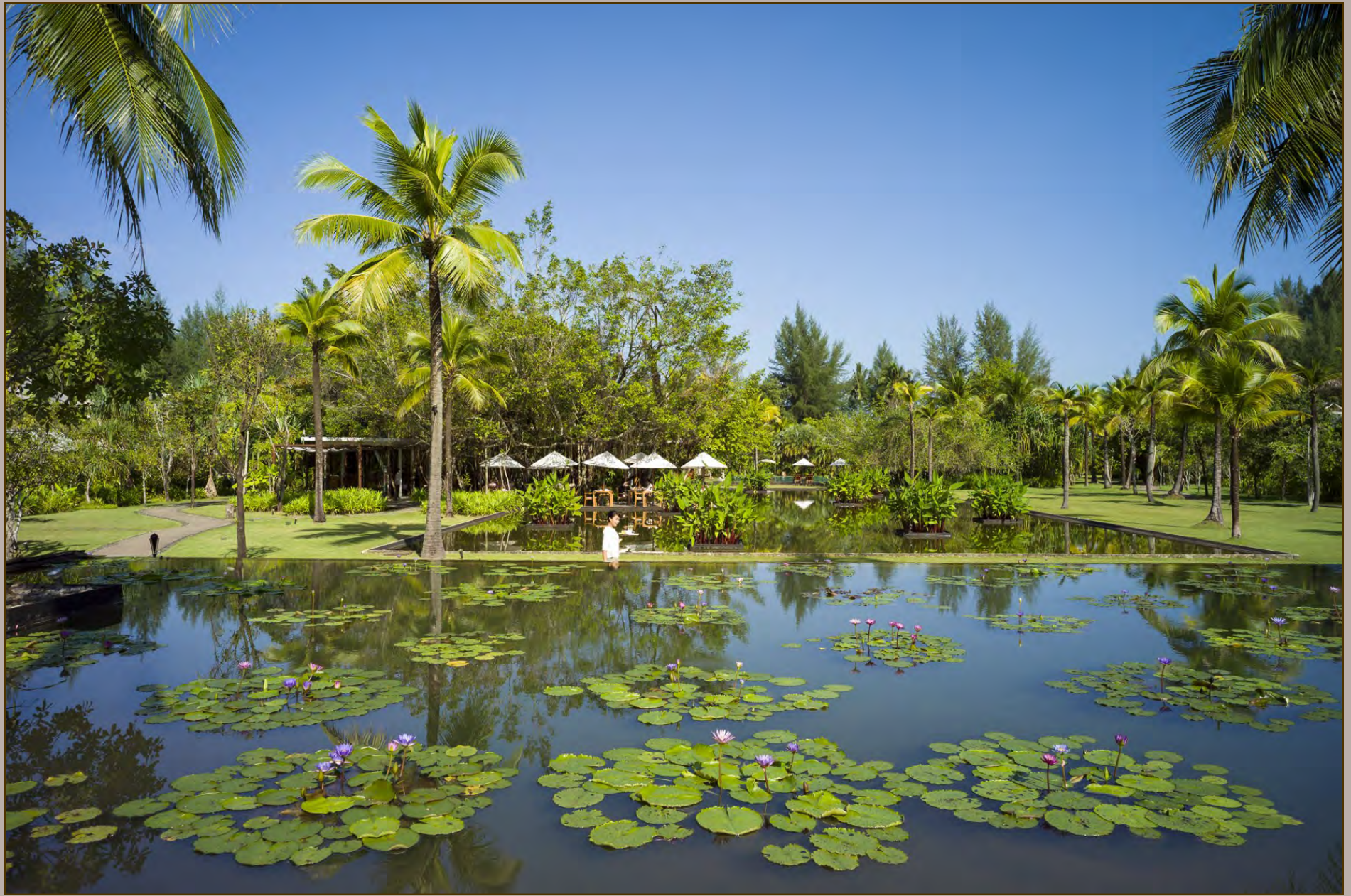
Fauna & Flora at The Sarojin